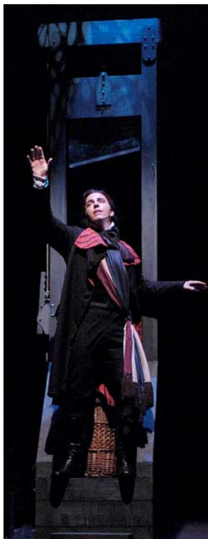
Chauvelin in The Scarlet Pimpernel