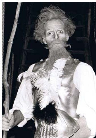
Don Quixote in Man of La Mancha