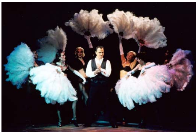
Billy Flynn in Chicago