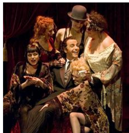
Macheath in Threepenny Opera